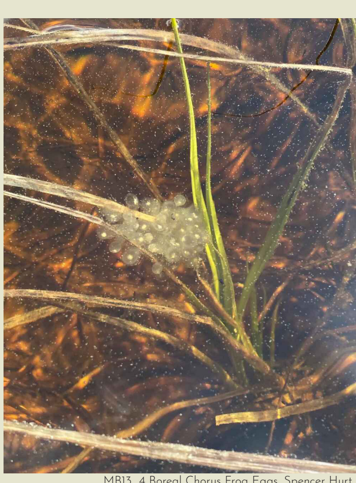
MB13_4 Boreal Chorus Frog Eggs, Spencer Hurt